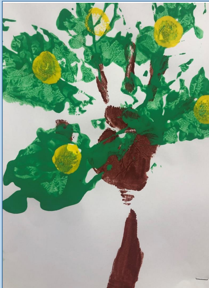
Loquat Tree Created by Caleb Horton (4 years old)