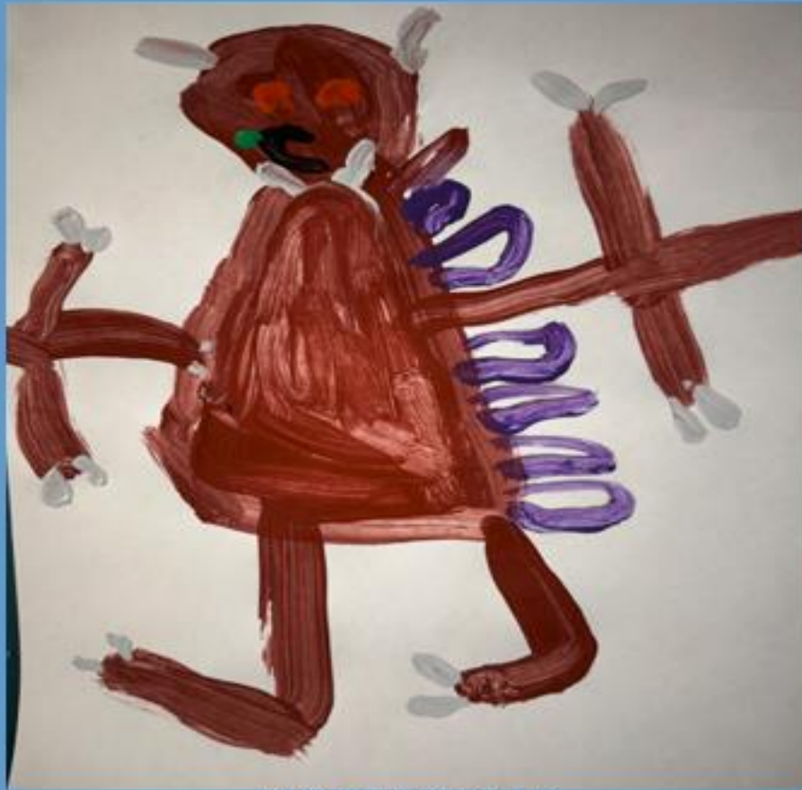
'THE GRUFFALO Created by - Isabella Herget (4 years old at time of painting)